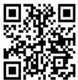
Whenuapai Online Safety Hub

As part of the school's package with Linewize, there is an Online Safety Hub you can use with articles about online safety. Scan this QR code to take you to this website: