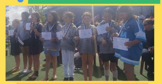
Yr 4 Falcons = 1st place (F grade)