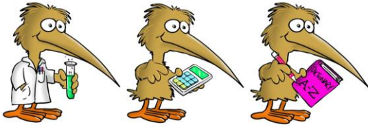
Kiwi Science Competition