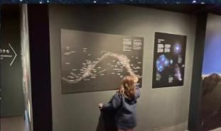
I really liked the scavenger hunt we did in the stardome.