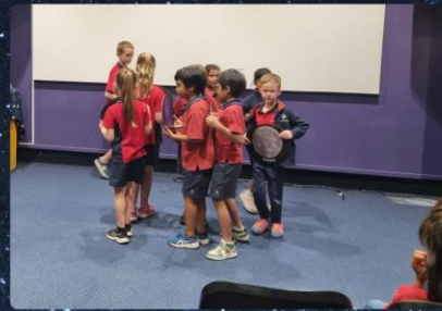
I liked watching the space movie at the stardome.