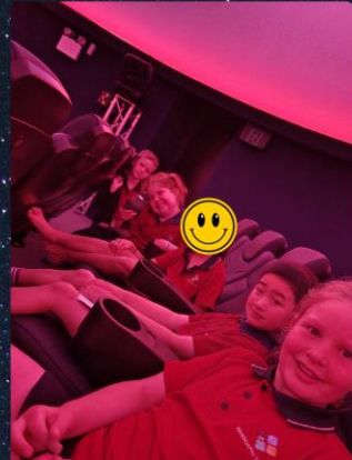
I liked working with my group.