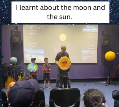
I learnt about the moon and the sun.